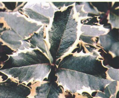
Ilex aquifolium 'Rubricaulis Aurea'