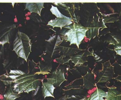
Ilex opaca 'Old Heavy Berry'