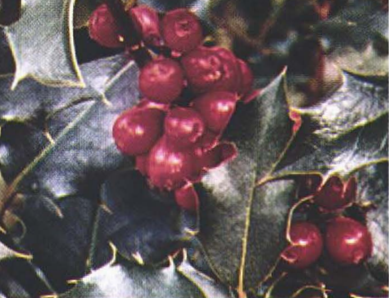
Ilex aquifolium 'Peter's'